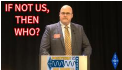
Thumbnail of the YouTube video. See video on ARRLHQ YouTube channel.

The Morongo Basin Amateur Radio Club Newsletter