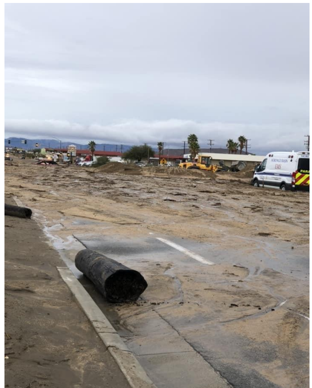
WHAT USED TO BE 29 PALMS HWY IN WEST SIDE JOSHUA TREE.