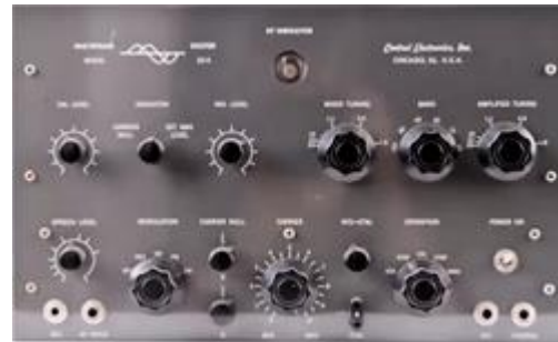
The Central Electronics Model 20A.