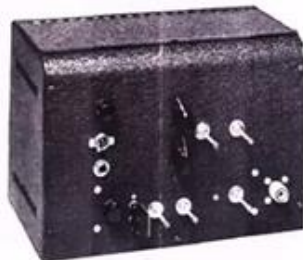
SSB, Jr. Presenting a 3-Tube 5-Watt SSB Transmitter with Superior Performance