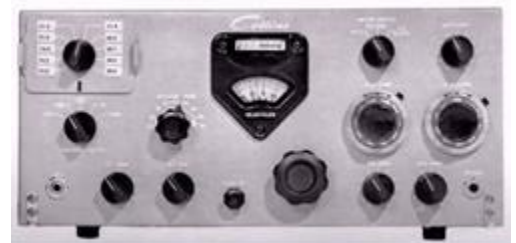
The Collins KWM-1 is considered the first "true" transceiver, sharing receive and transmit circuitry.

In the same decade, General Curtis LeMay,