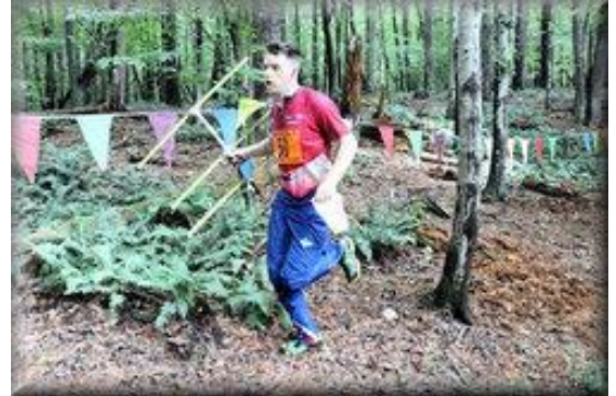
Postponed in 2020, the 2021 ARDF USA Championships will take place October 13 - 17 in North Carolina.

optional practice days are planned for Sunday through Tuesday, October 10 - 12, just prior to the championships. A practice event on Sunday in Chapel Hill, North Carolina, will provide the experience of a full ARDF course in a friendly environment, with the clock as the only opponent. The practices on Monday and Tuesday will be held in Durham, North Carolina, and will offer informal sessions in which the participants help with setting the transmitters in the woods.