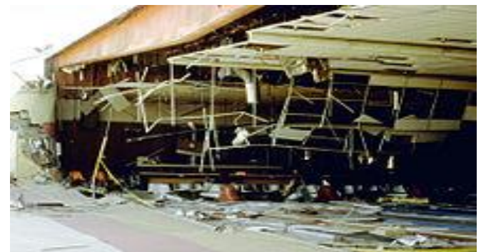
Old woman springs road/Hwy 247 took a hit on many places like this, as well as the epicenter at Aberdeen just east of Hwy 247.

These are pictures of the east side wall of the yucca valley bowling alley.