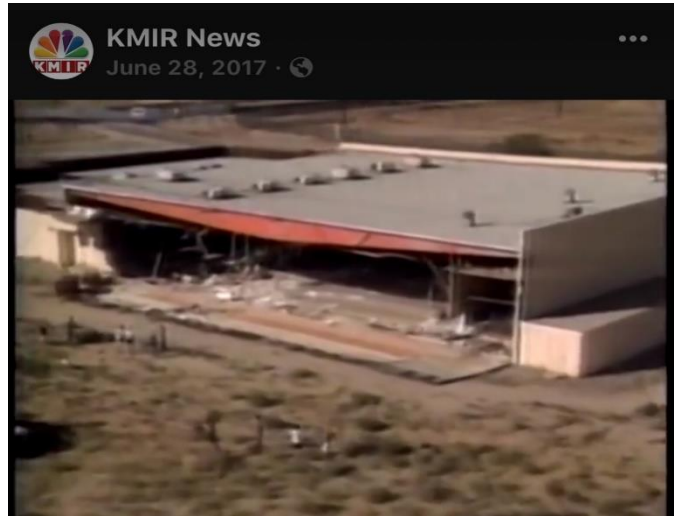
A friendly reminder of OUR Landers Quake of 1992 I was here and I remember it well!

At 4:57 a.m. local time (11:57 UTC ) on June 28, 1992, a magnitude 7.3 earthquake awoke much of Southern California. Though it turned out it was not the so-called "Big One" as many people would think, it was still a very strong earthquake. The shaking lasted for two to three minutes. Although this earthquake was much more powerful than the 1994 Northridge earthquake , the damage and loss of life were minimized by its location in the sparsely-populated Mojave Desert .