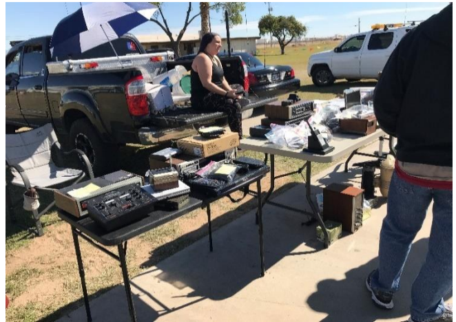
THERE WAS PLENTY TO CHOOSE FROM