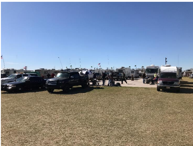
THE SWAP MEET. AND THE WEATHER WAS GREAT.