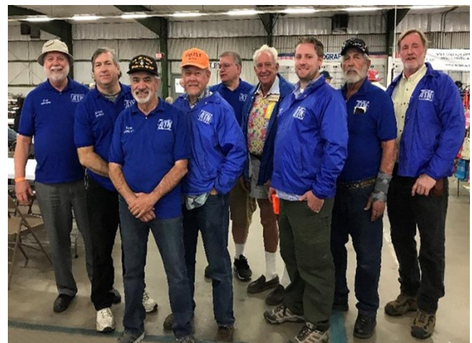
The ATN Group had a great showing of 9 ATVers! https://atn-tv.org