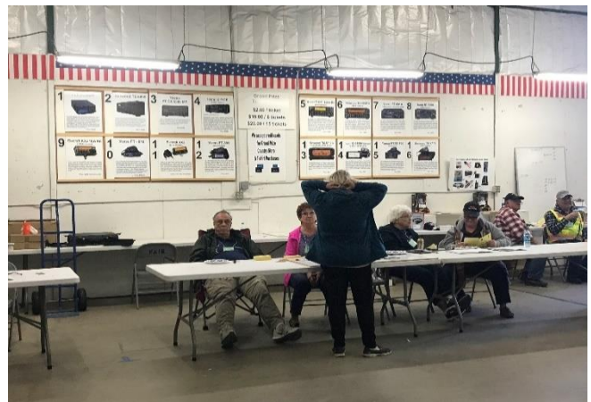
LOTS OF GREAT PRIZES!