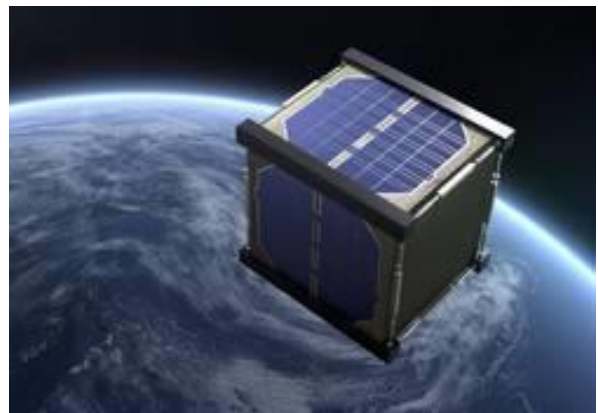
An artist's depiction of LignoSat.

The LignoSat application for IARU Satellite Frequency Coordination in December said the CubeSat would carry amateur radio equipment that will extract call signs of amateur radio stations from uplinked FM packet signals and respond to them via the CW downlink and the sender's call signs to convey thank you messages. The plan proposes UHF downlinks for CW and FM.