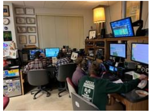
Missouri S&T Amateur Radio Club members operate from their shack.

The club now has 20 active members and over 300 alumni that regularly visit to help support club activities.