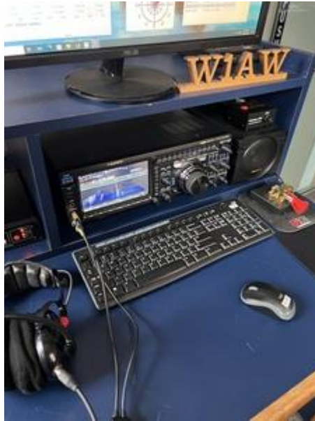
The Yaesu FTDX101MP transceiver is a welcome addition to Studio 1 in W1AW, the Hiram Percy Maxim Memorial Station.