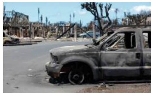
Damaged buildings and vehicles in Lahaina.

President Biden visited the island on Monday, August 21, 2023, and told residents the federal